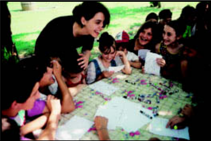
Children in Georgia attend psychosocial rehabilitation classes after being uprooted from their homes for years.