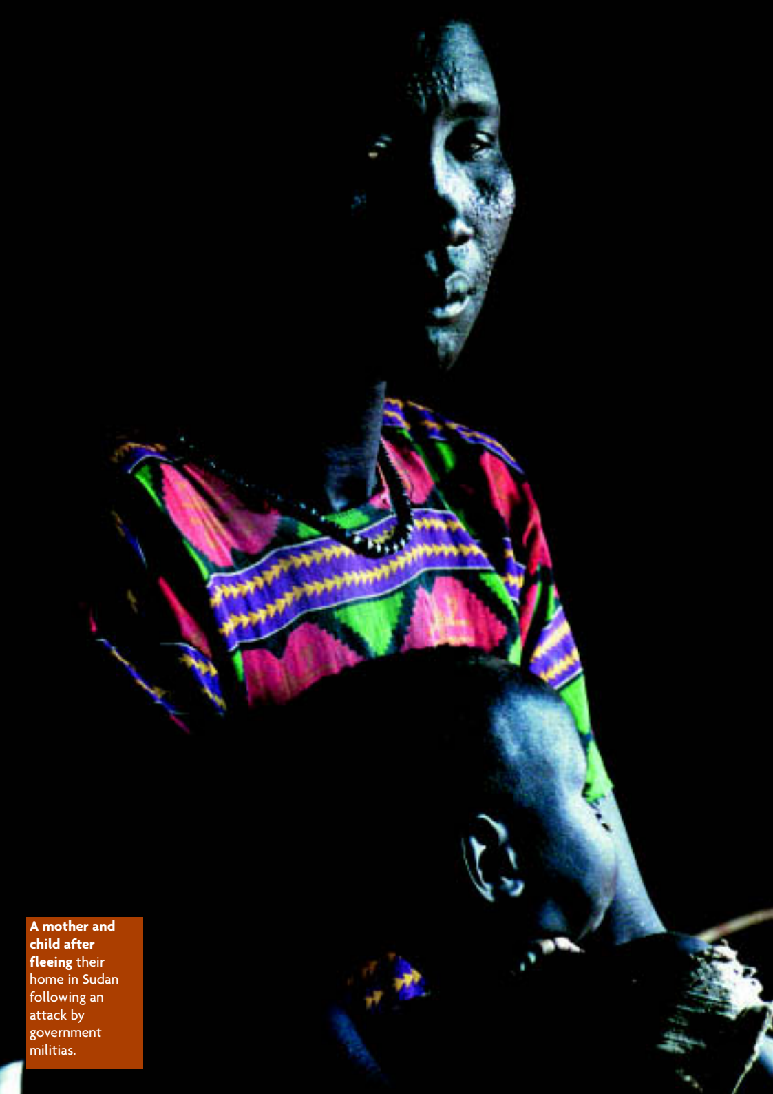
A mother and child after fleeing their home in Sudan following an attack by government militias.