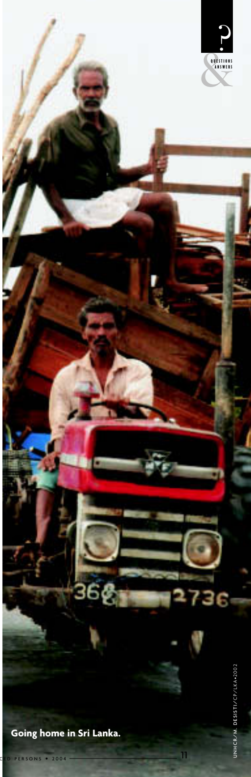
Going home in Sri Lanka.

These civilians received limited assistance in the past. The International Committee of the Red Cross, as the guardian of the Geneva Conventions, has been active in this field for many decades and other agencies and governments began a wider debate in the last few years on how to tackle the crisis and who should be involved. The U.N. Special Representative produced a booklet, Guiding Principles on Internal Displacement , which contains 30 pointers for governments and humanitarian organizations to help the displaced.