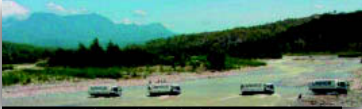
A UNHCR convoy of uprooted peoples heads home to Timor-Leste.