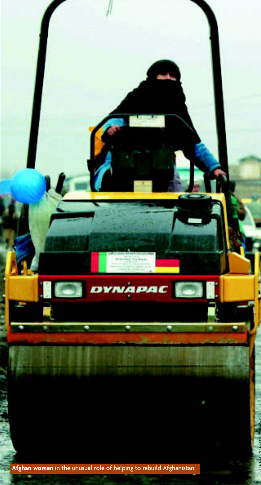
Afghan women in the unusual role of helping to rebuild Afghanistan.