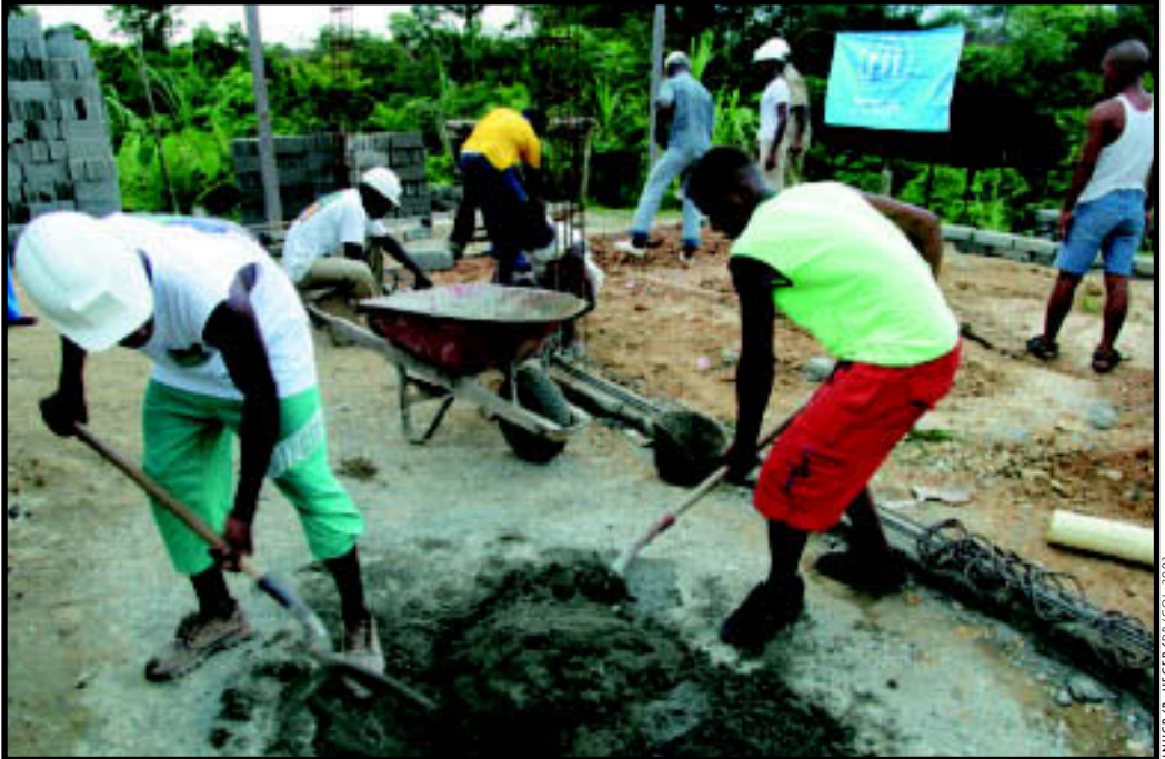
A self-help rebuilding project in Colombia.

The overall number of internally displaced remained relatively stable at around 25 million in the first years of the new millennium. However, there were still significant population movements with several million people in countries such as Afghanistan, Angola, Bosnia and Sri Lanka returning home, but similar numbers being displaced in Colombia, Burundi, Africa’s Congo basin, Sudan and other regions.