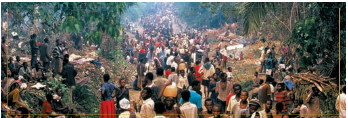
Rwandan Refugees in the Kisangani Region of Zaire, 1997.

In our lives we all must show courage, we all get the chance to, no matter big or small the situation may be we should all be brave enough to rise to the occasion.