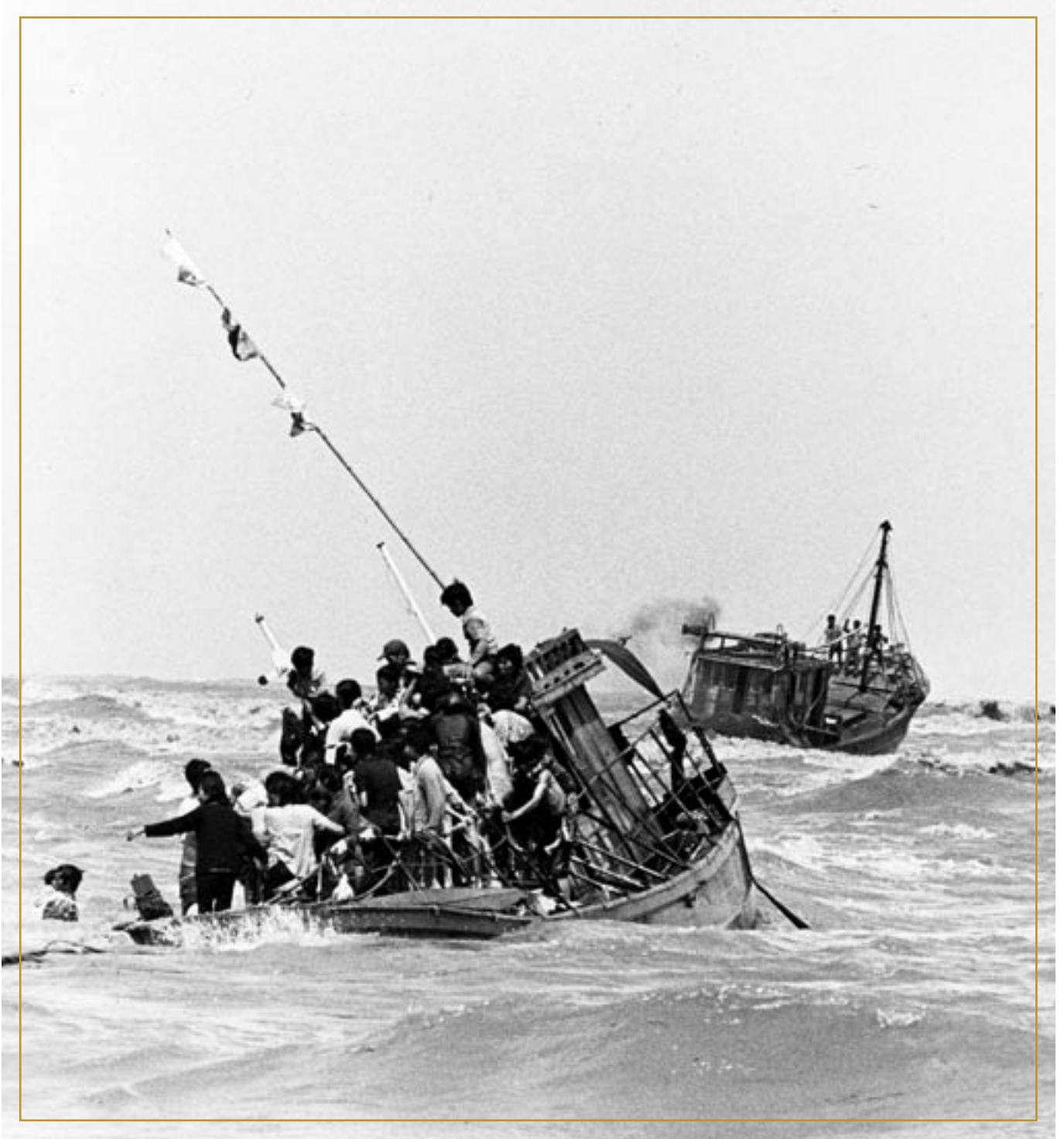
Vietnamese Refugees, 1978.