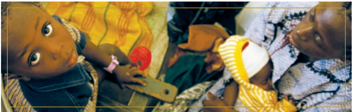
Sierra Leone: Voluntary repatriation from Liberia.

I believe that many young people would most likely not know much about refugees. Most students coming from a similar background to mine, going to a great school like Kincoppal Rose-Bay and receiving different opportunities, wouldn't know much about refugees. I was part of that group of students before I entered this competition and I have since then expanded my knowledge. I am glad as this is not a topic which I believe today's society should ignore.