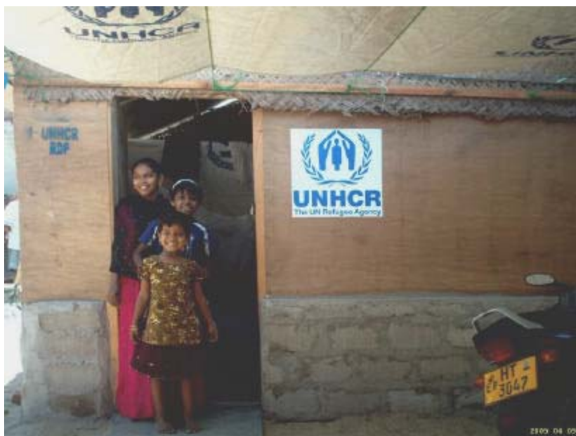
A family in front of their new home, built by UNHCR through its implementing partner, RDF, in Ampara District, Sri Lanka.

One of UNHCR's most important functions is to assist the Government and all authorities to protect the internally dis-