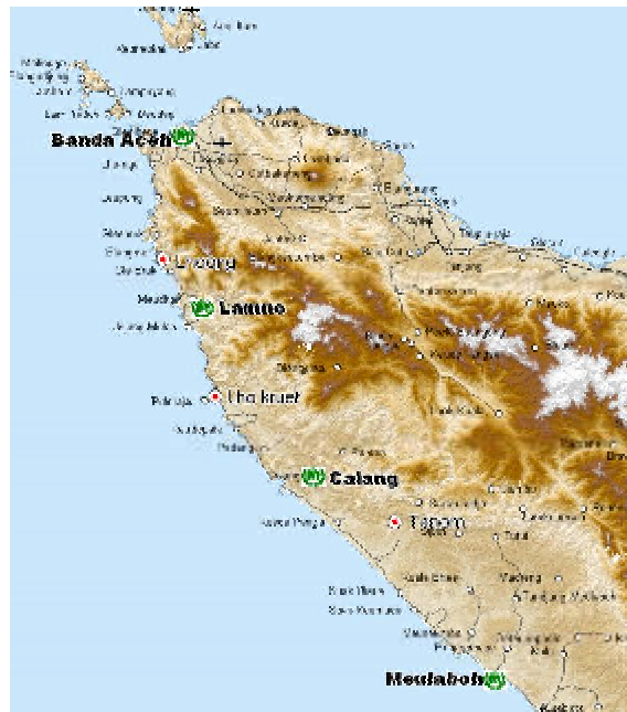
UNHCR presence in Aceh Province: Jan-March 05

UNHCR also worked with the Government and other actors to support efforts which pursued permanent shelter solutions. This