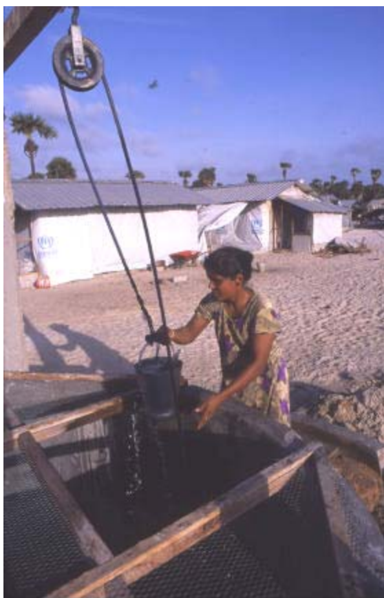
A displaced woman in Nathampiron welfare centre in Jaffna District, Sri Lanka, draws water from a well, her newly-built shelter by UNHCR behind.

Within the days following the calamity, UNHCR swiftly mobilized its emergency resources to provide immediate assistance in Indonesia and Sri Lanka. Although UNHCR is not traditionally involved in natural disasters, the sheer magnitude of the devastation, the fact that UNHCR had on-the-ground presence and emergency capacities to respond swiftly, and that many of the affected populations are of concern to the Office, prompted a positive reply to the request by the UN Country Team for UNHCR's involvement.