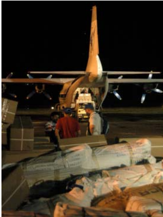
One of the first deliveries of relief items in Banda Aceh.

collaboration resulted in more family-friendly and gender-conscious design of temporary shelters, as well as the design of an integrated shelter programme with a view to the imminent start of rehabilitation activities.