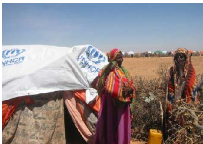
Following an NFI distribution to an IDP community including those displaced by the tsunami at Yaka-Yaka, Puntland.

construction of municipality buildings; provision of skills training for women and funds for small-scale income generating activities; and rehabilitation of key feeder roads leading to Hafun, Bender Beyla, Eyl and Garaa'd through food and cash for work.